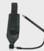
• 94ACC0133 Hand Strap (Included with purchase)