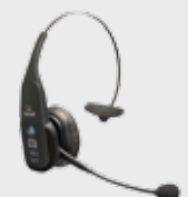
• 94ACC0127 Bluetooth Headset VXI B350-XT