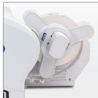
Large Media Supply