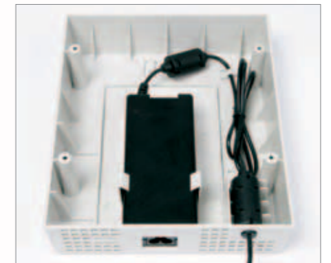
An optional power supply tray for retail installations