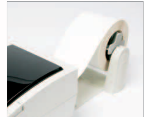
A wide range of options, including an external media stand