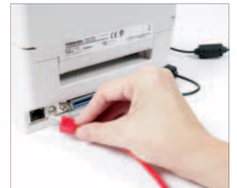
Built-in networking as standard with a 10/100Mbps LAN interface