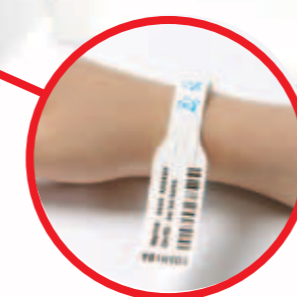
So versatile that even specialized labels and tags can be printed with ease