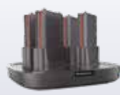
94ACC0192 4-Slot Battery Charger